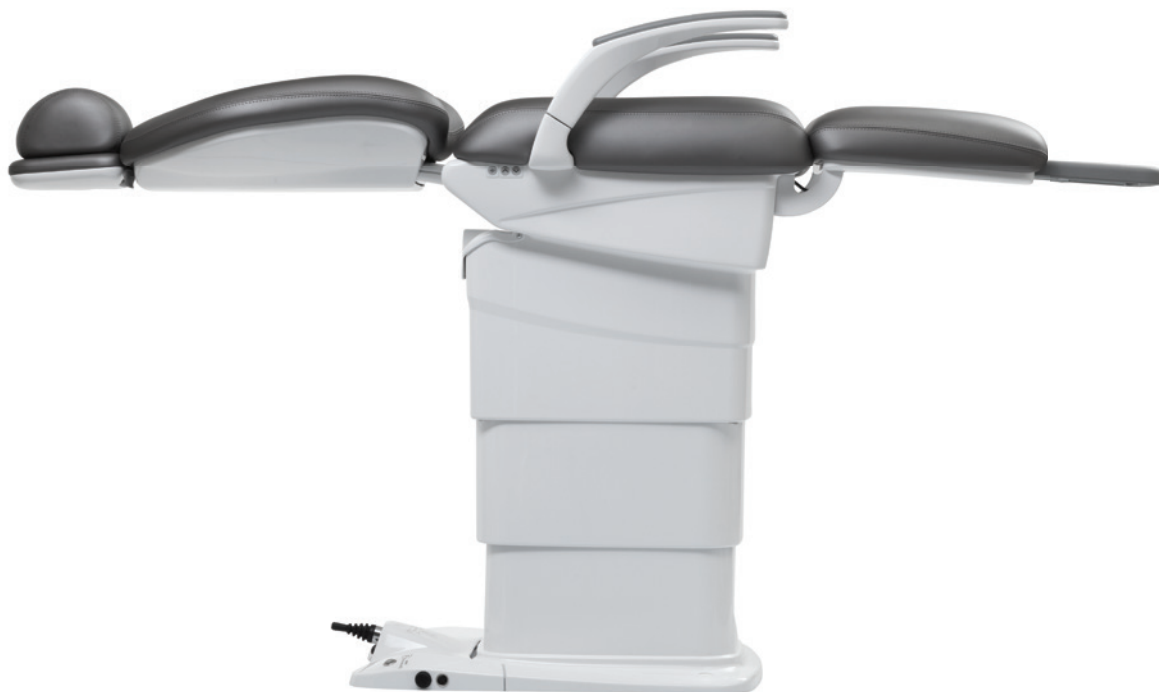
Motorized backrest height adjustment